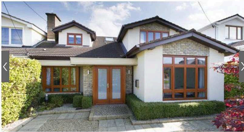
The house was extensively renovated in 2007